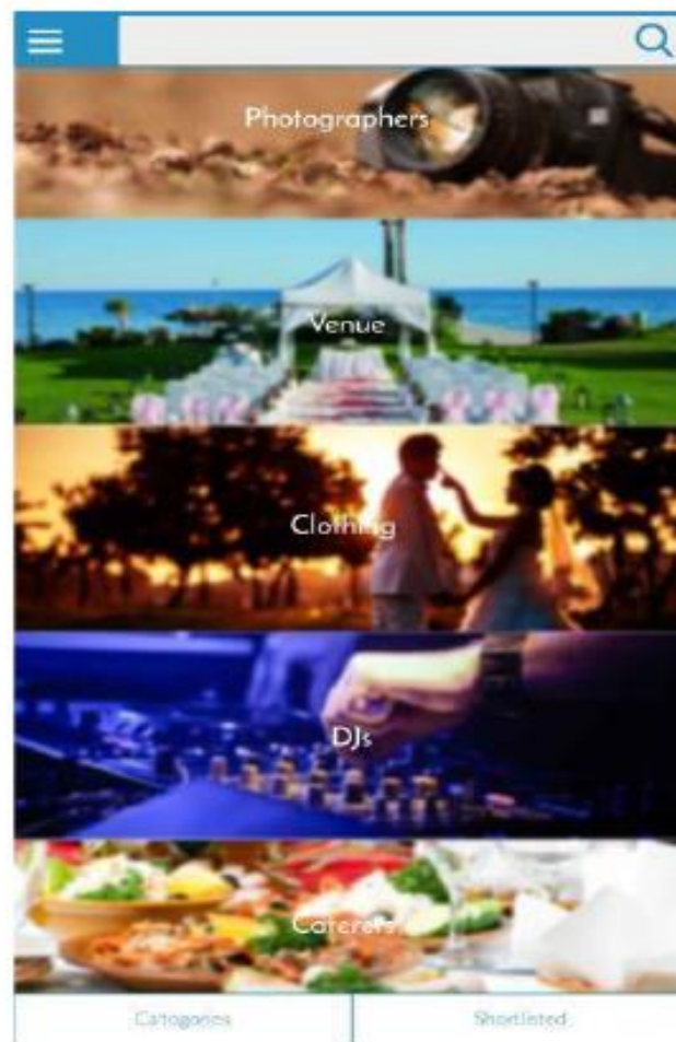
Figure 2: Search and Select Module

Once the user has logged inside the application, they can use the search bar to search for a specific vendor or they can use categorized buttons to search for a specific category. The sort button allows the user to sort the search results according to consumer's needs. Upon tapping any button a new screen will appear which will show the search results.