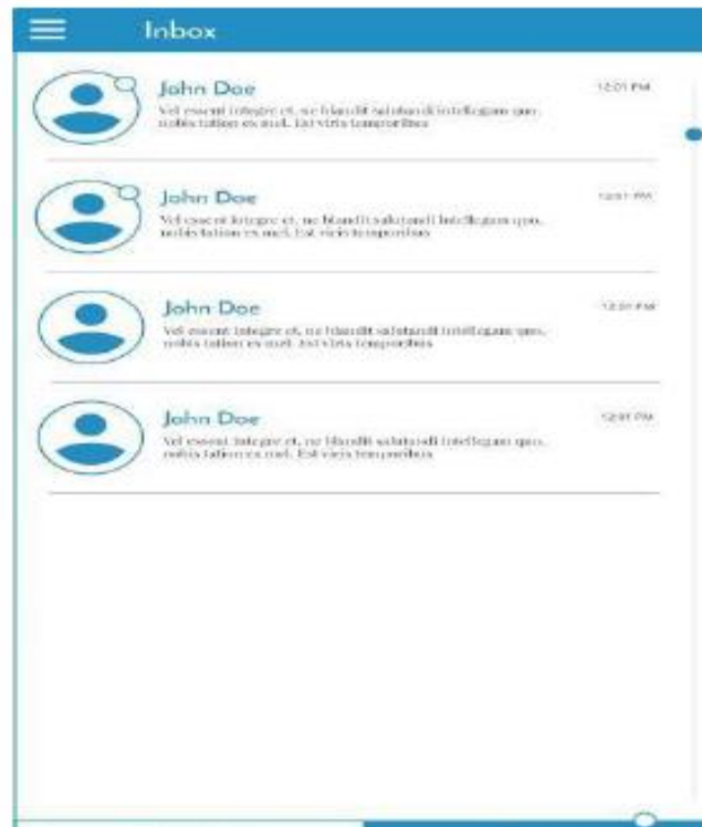
Figure 4: Messaging Module