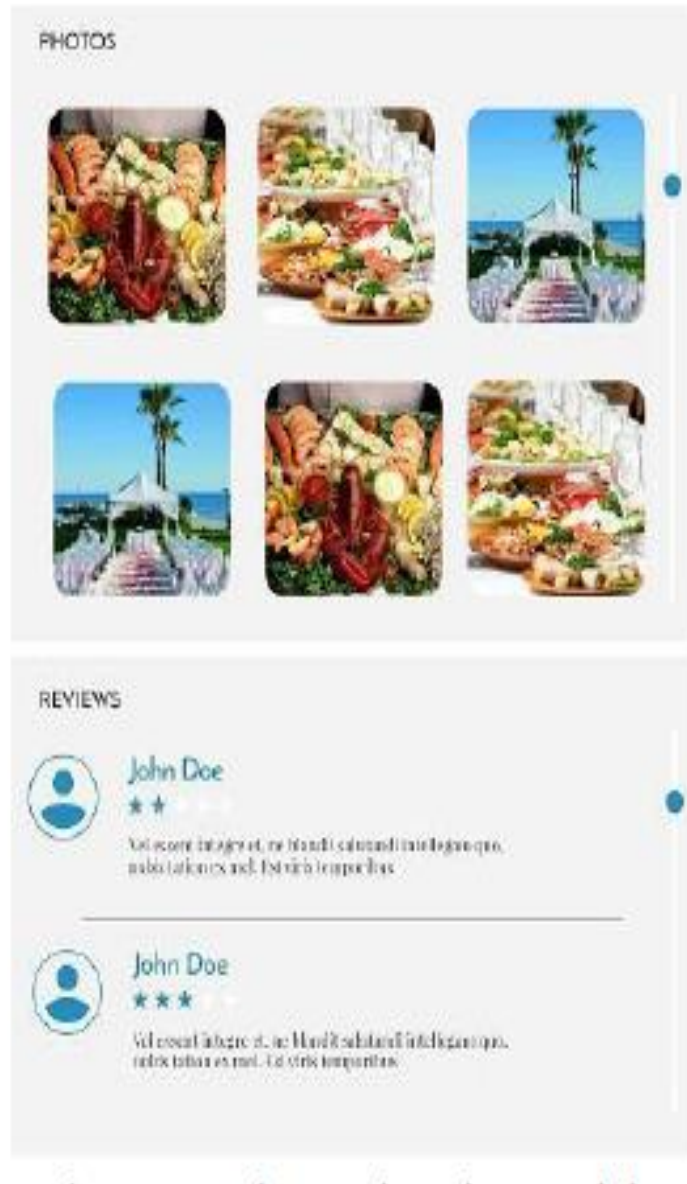
Figure 3: Ratings and Review Module

hosted on webserver. Users can easily read these ratings and reviews from the application and then compare vendors according to their ratings. This will allow the consumer to prioritize and customize his options and select a vendor accordingly.